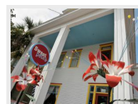
Jacksonville candy store Sweet Pete's gets new partner, future