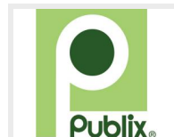
April Fools joke targeted at Publix gets social media traction leaving sub loving fans wishing it were true