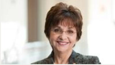
Pictures: Orlando power brokers

Photos: 100 years of U.S. presidential races